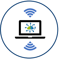
Pilot 02: offene Transport-Management-Plattform