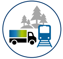
Pilot 01: smarte Holzlogistik