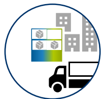
Pilot 04: neue letzte KEP-Meile