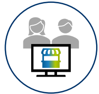
Pilot 03: Supply Chain 3.0